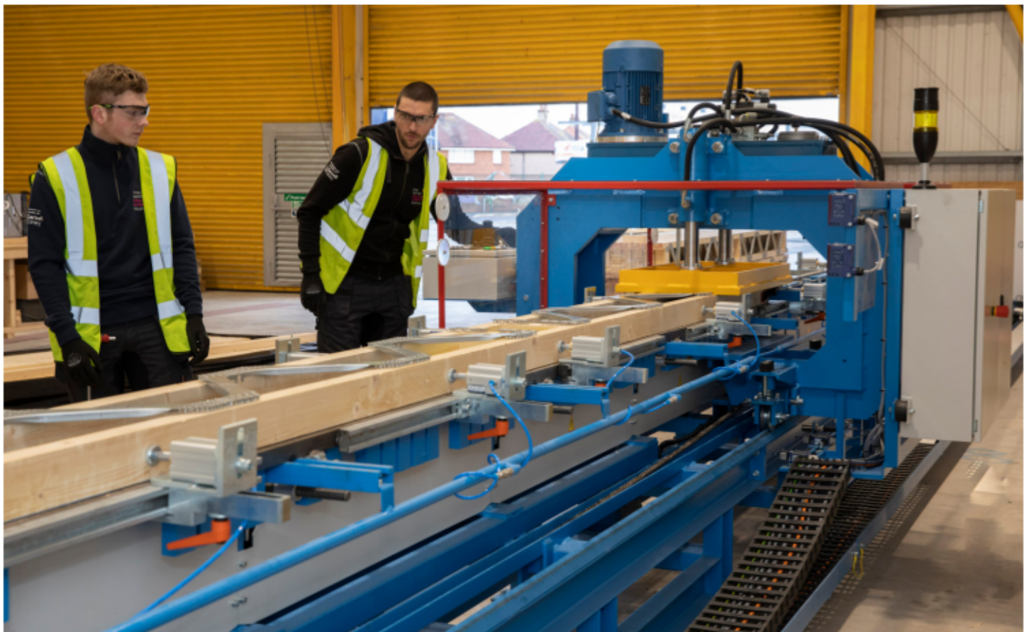
Creating Enterprise, Conwy

In November 2020, it was named as the Fastest Growing Company in Wales. This team is the perfect example of how social enterprise can deliver on its three ambitions: business success, environmental sustainability, and helping people.