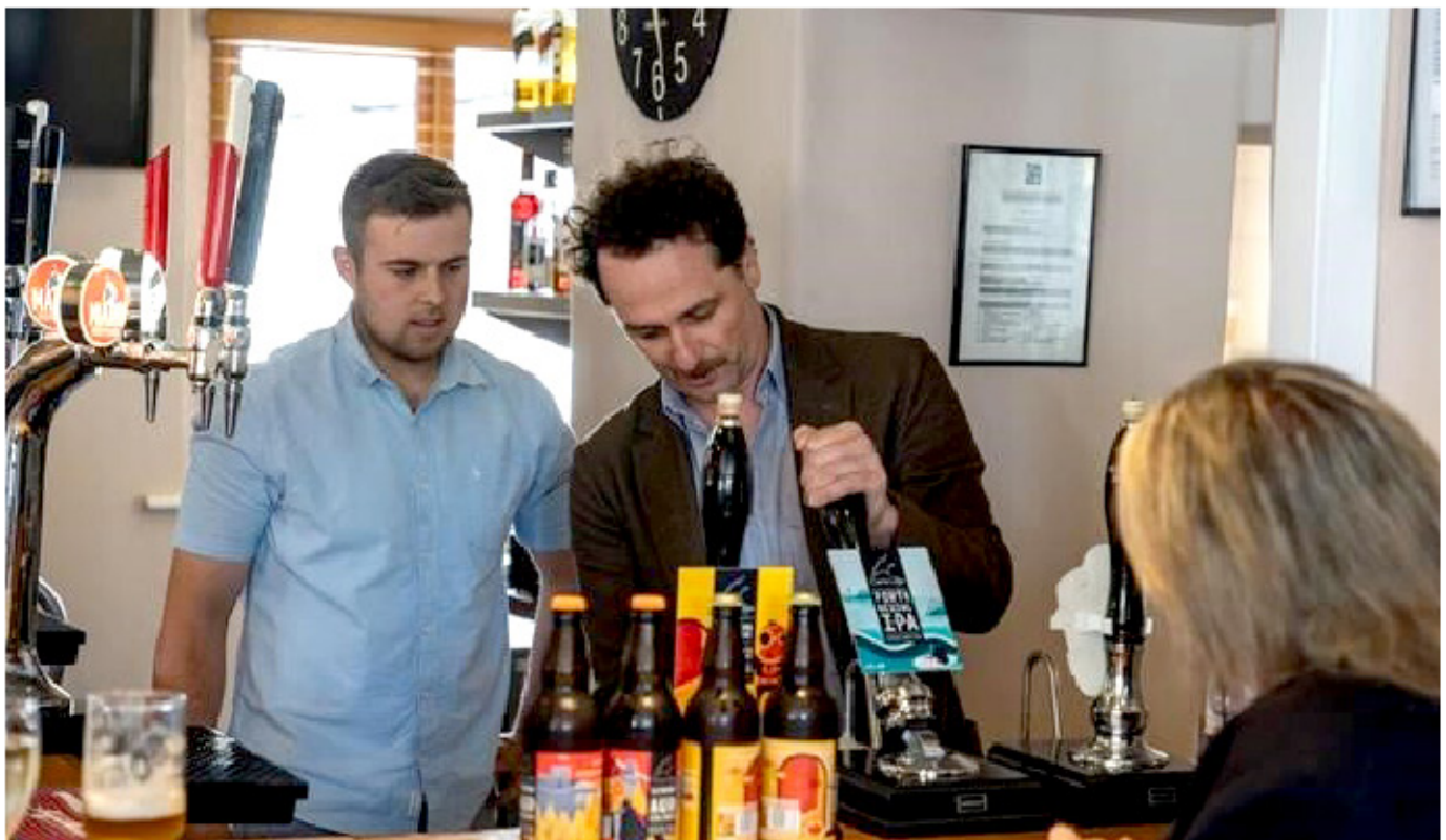
Menter y Glan, Pennal

Delivering specialist support to social enterprise and social entrepreneurs is essential to the continued growth and development of the sector, as well as to existing social enterprises as they seek to maximise their impact and face the challenges of the future. Ensuring a strong social enterprise sector is essential to realising a shift in the economic model that will deliver a fairer and more prosperous Wales, and one with the planet at the heart. In the current time of complex and multiple global crises, this has never been more important.