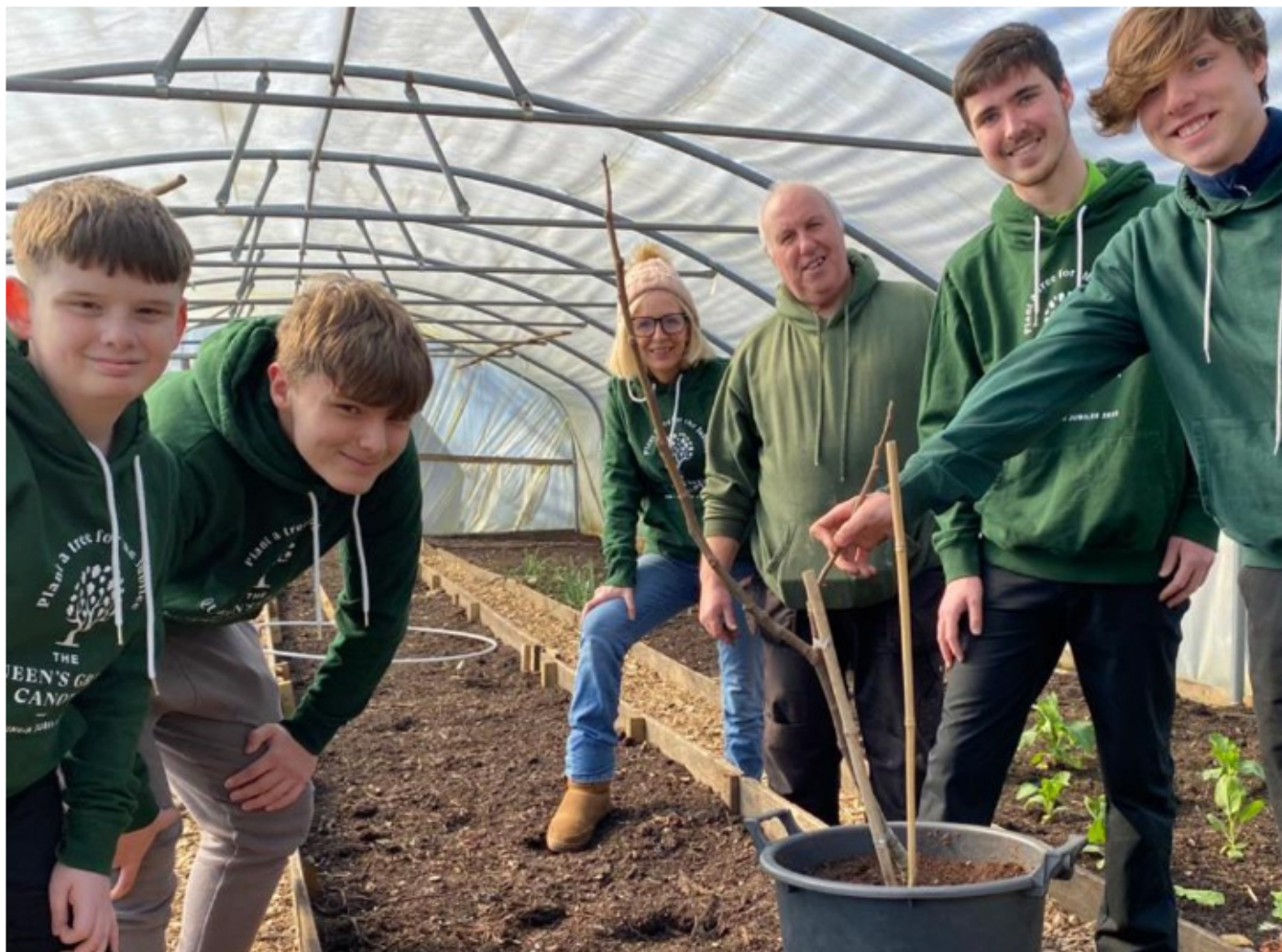
Cynon Valley Organic Adventures, Rhondda Cynon Taf

New legislation and strategies in Wales, such as the Social Partnership Bill and the Wales Anti-Racist Action Plan are putting fair work and equality, diversity and inclusion at the heart of the policy agenda. Our research shows that 66 percent of social enterprises in Wales pay the living wage to all staff, highlighting how Fair Work is at the heart of the business model. However, we want to see this expand further, and we have recently started working with Cynnal Cymru to ensure that every organisation on the Social Enterprise Stakeholder Group is an accredited living wage employer and that we can provide the best possible awareness-raising and support for the sector. In addition, the Community Asset Loan Fund offers interest rate reductions for climate change action and National Living Wage accreditation.